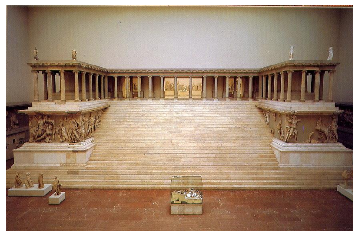
The reconstruction of the altar of Zeus in the Pergamum Museum, Berlin, Germany. The friezes are from the actual archaeological site.

of the mountain (acropolis) and was built in the first half of the second century BC. It was excavated in the late 1800s, and its friezes were sent to Berlin. Later, this structure was used as the model for the building of the Tribune at Zepplin Field in Nuremburg. Hitler often visited this structure.